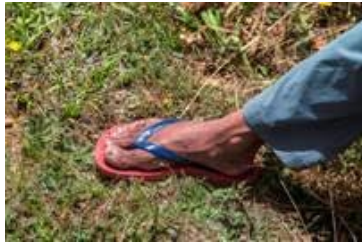
Sinhalese hiking boots

Another day we were taken to the hill country for trekking in one of the most remote Tamil plantations. It was a hard trip, 20 km in length and 1000 m vertically. While we were trekking in high-tech boots (as the terrain was hilly and required bushwalking in places), Sid and our Tamil trekker were effortlessly walking in their flip-flops (and waiting for us all the time). We realized how spoiled we are and how tough are the locals.