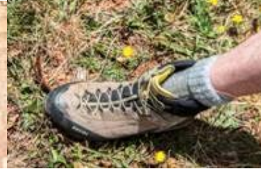
Westerner's hiking boots

Another day Sid got up at 4am to drive us from Ella to Lipton's Seat for a wonderful sunrise. We were the only people who managed to get there in time.