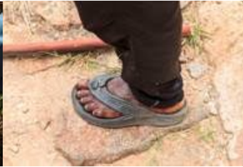
Tamils hiking boots